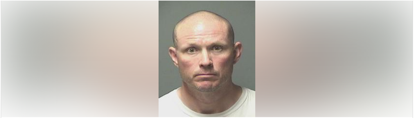
Prominent lobbyist facing domestic violence charges